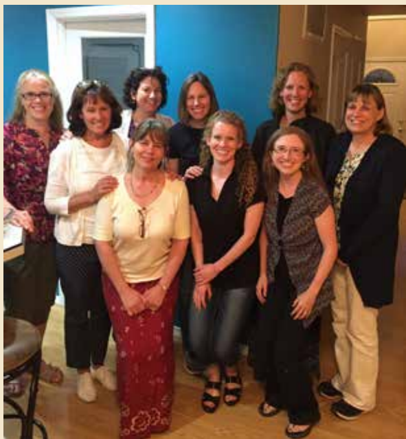
figure things out for themselves. She was our greatest source of ideas and then our greatest source of encouragement and support.