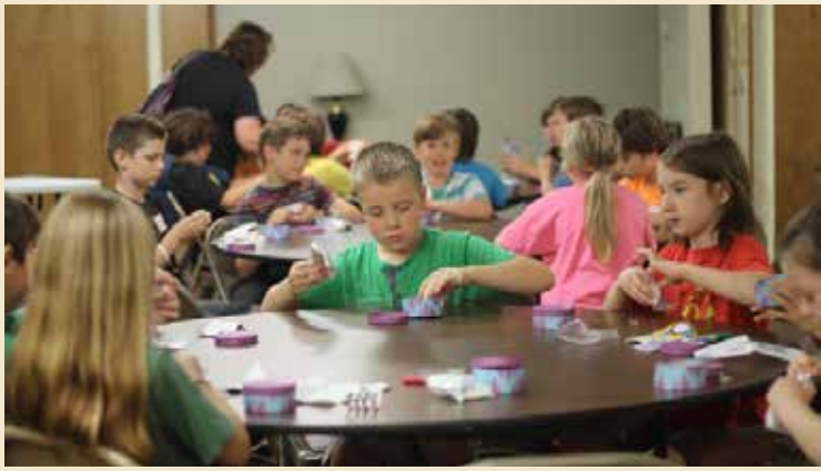
◀ Creating hope/prayer boxes in the Imagination Station.