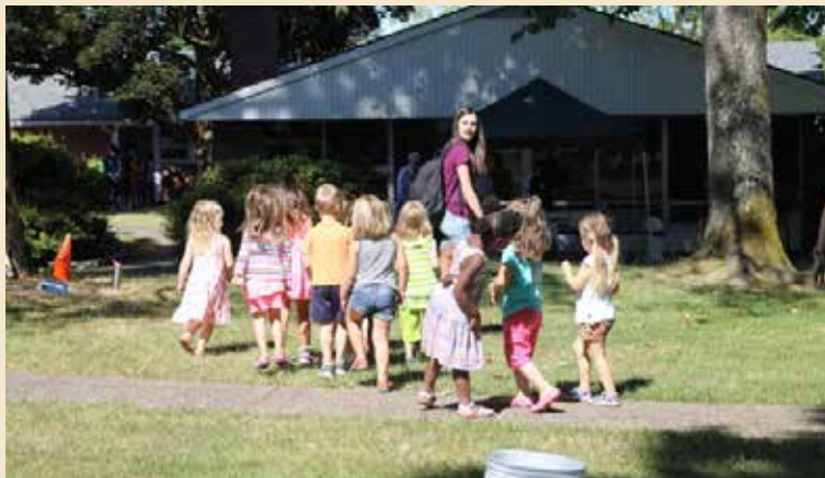
◀ VBS always includes lining up and following your leaders.