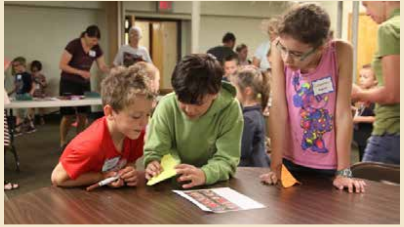
Some of our recent 5th grade grads enjoyed their ▶ first year as VBS volunteers.