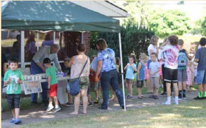
Snack ▶ time is a huge hit at VBS.