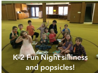
K-2 Fun Night silliness and popsicles!