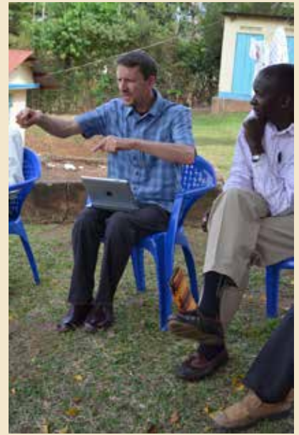
Here I am on a coaching trip.

I have a deep sense of gratitude to God for his faithfulness in our lives, for letting us partner with him in bringing transformation to the lives of many people in Rwanda. We have friends in various communities who understand God's love for them in a new way, giving them a greater joy and deeper desire to "love their neighbor." We have seen families set free from a cycle of debt, who are instead finding ways to save money. Some have started small business ventures, bringing more resources to help meet their families' needs. We have seen