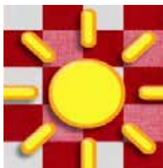
Photo Review of NFC's Kick-Off-the-Fall Potluck Picnic by Gary Fawver