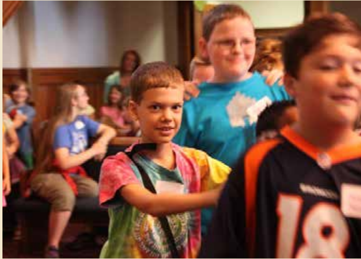
CONGA through the sanctuary.