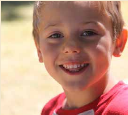
Laughing, dancing, and worship all happen first thing in the morning at VBS!