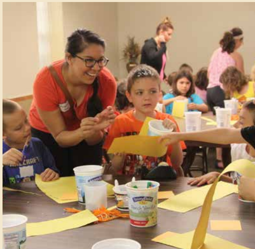
Volunteers from Newberg Foursquare and several other churches in town make VBS possible!